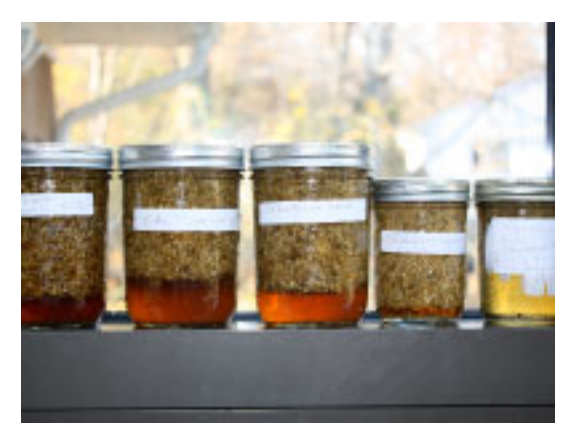
elderflower syrup

by Dana Woodruff, <u>Dandelioness Herbals</u>